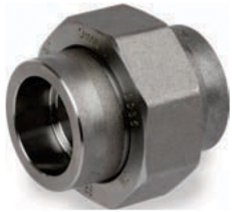
Fig. 52U 3 – Union